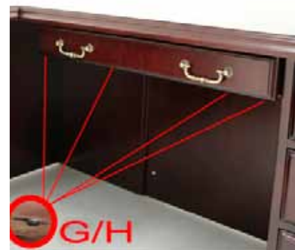
FIGURE 2: TO TAKE OUT DRAWERS : PULL OUT FULLY AND LIFT ONE TRIGGER UP AND PRESS OPPOSITE TRIGGER DOWN AND PULL.

STEP 8 : Attach center drawer (O) to underside of credenza with 4 long bolts and washers (G/H) each.